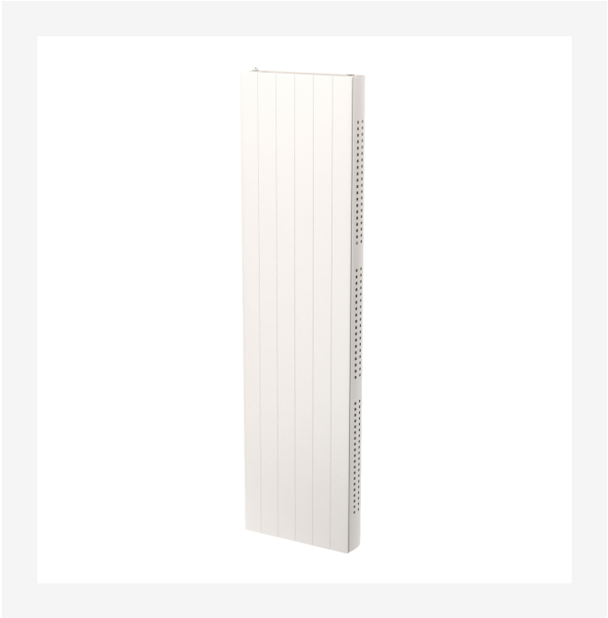
VN_iVector S2_Vido S2 Valve connection extension_image_2000x2000